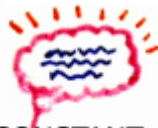
CONSTANT THINKING & WORRY