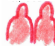
SPEND TIME W/ FRIENDS OR FAMILY