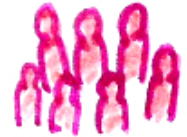
JOIN A GROUP