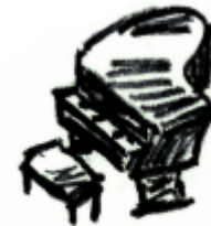
MUSICAL INSTRUMENT OR SING