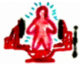
TINGLY OR TENSION