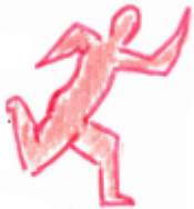
EXERCISE OR GO OUTSIDE