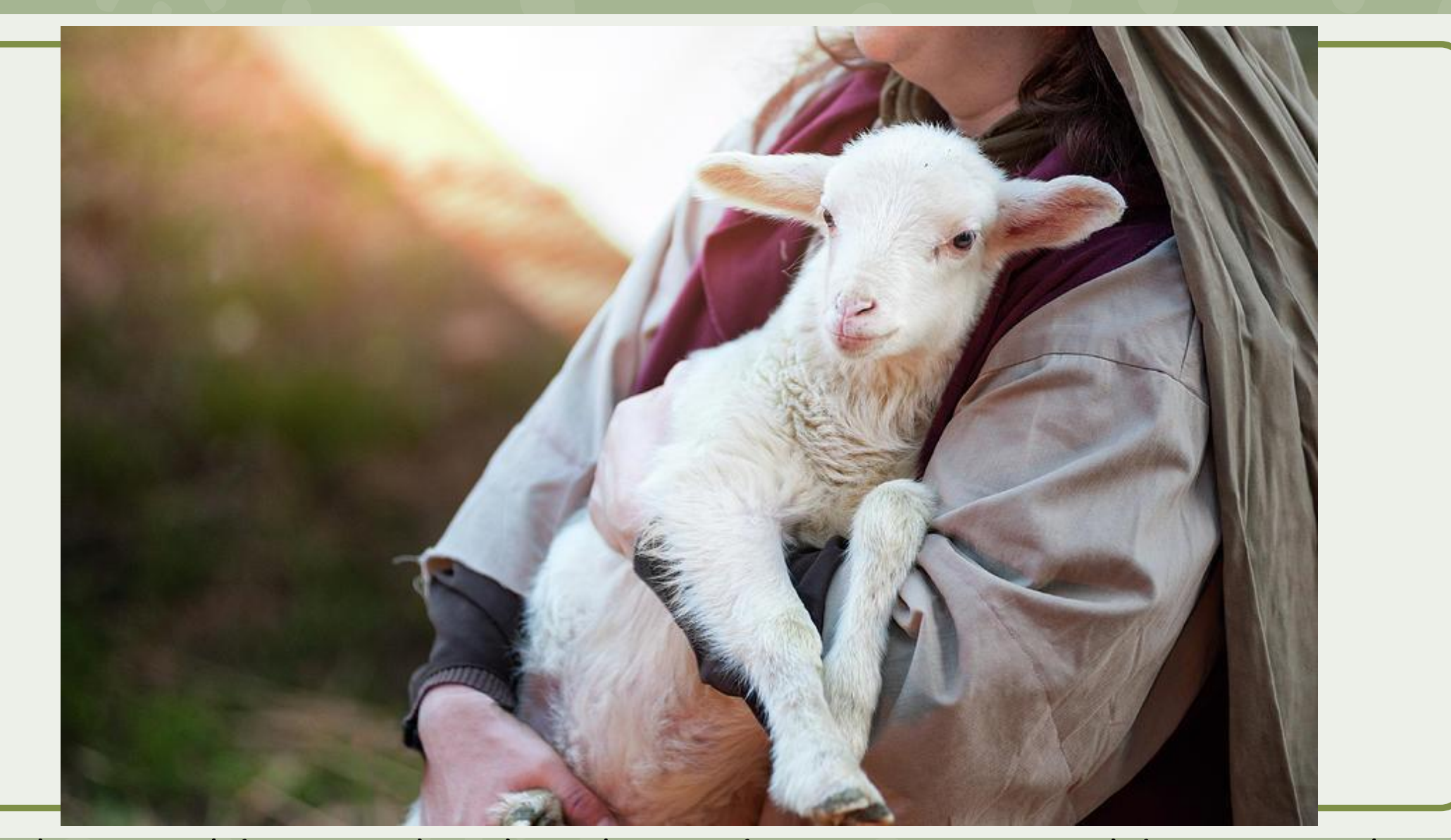
The Lord is my shepherd He gives me everything I need