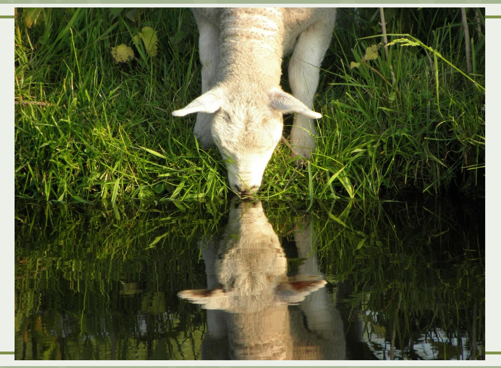
He leads me beside quiet waters