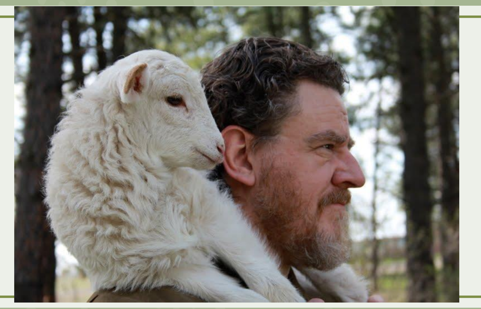
He gives me new strength