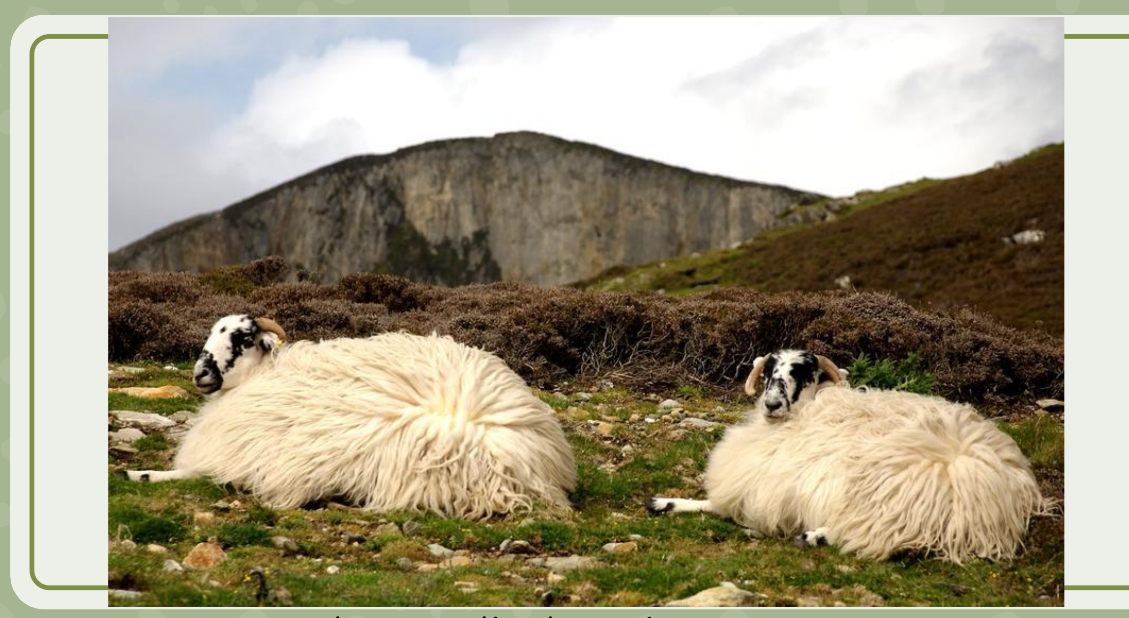
He lets me lie down in green grass